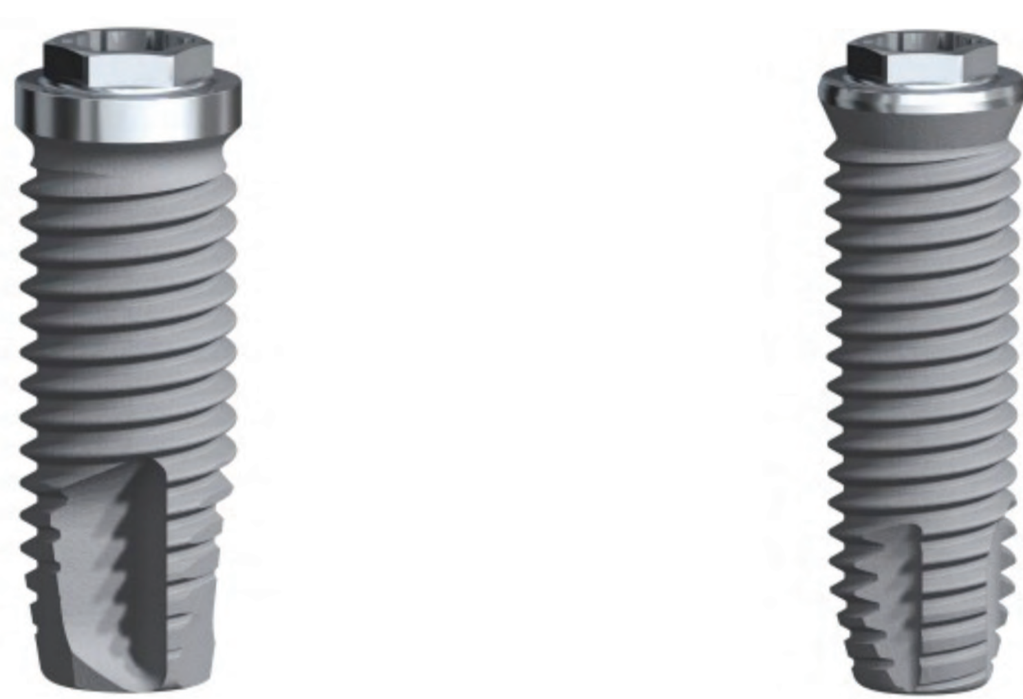
Figure 1: Study implants: Brånemark System Mk III (left panel) and Mk IV (right panel) implant with anodized surface.